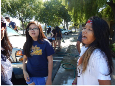
A list of Officers

Thank you for working so hard during the DCM and car wash to get us so many customers! You were great during the presentation of what we did, and I look forward to hearing you speak again on the monthly topics this coming DCM. Keep being that great president you were!