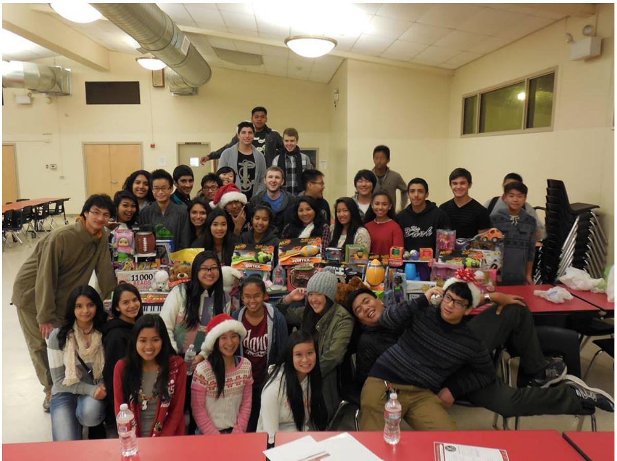
Last Month's DCM (and Our Winning Division Service Project) – See Feature Article