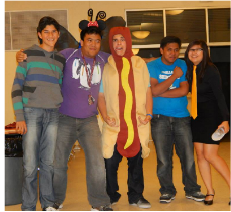
Photo Collage including: Pie Fundraiser, Heads-Up Seven-Up at the DCM, Fall Rally, and Costume Contest at the DCM

[Modesto High School, Volume 1, Edition 5]